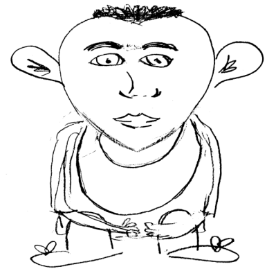
Here is a picture of the results of the simulation of the baby lab.