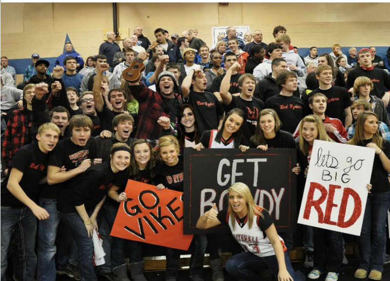
Pictured above are the Red Ryders at the Montague-Whitehall Basketball game.