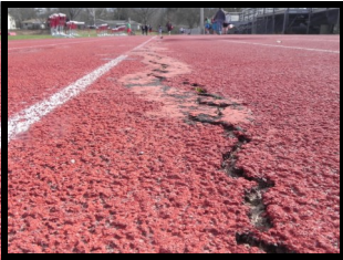
A picture of the current condition of the track.