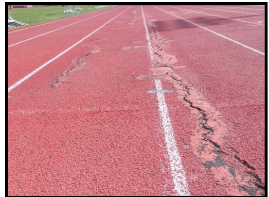
This is one of many cracks in the track that will be replaced with the renovations.