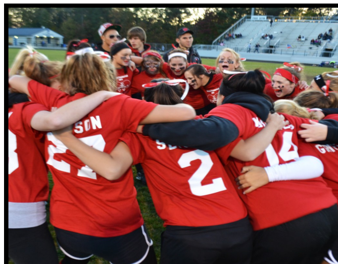
The team gets pumped up before its game.