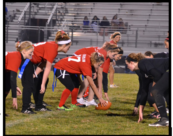
Whitehall offense gets ready to hand off the ball during the varsity game.