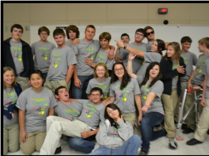
The marching band gathers for a silly photo in the band room.

The final score ended up as 14-8, with the